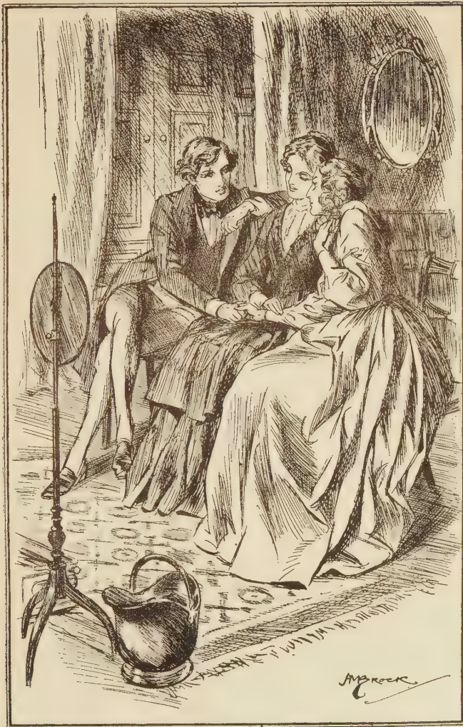
The Young Lovers confide in Esther